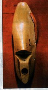
A last is a form that can be customized in making a fitter's model.