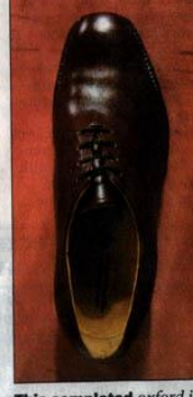
This completed oxford made with water buffalo leather.