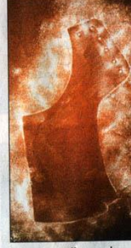
A powder outline marks the area to be cut out of the leather.