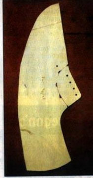
A pattern piece is placed on the leather to mark the area to be cut out.